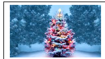
Plate Night Friday 18 December

Merry Christmas to you all and all the best for a great 2021